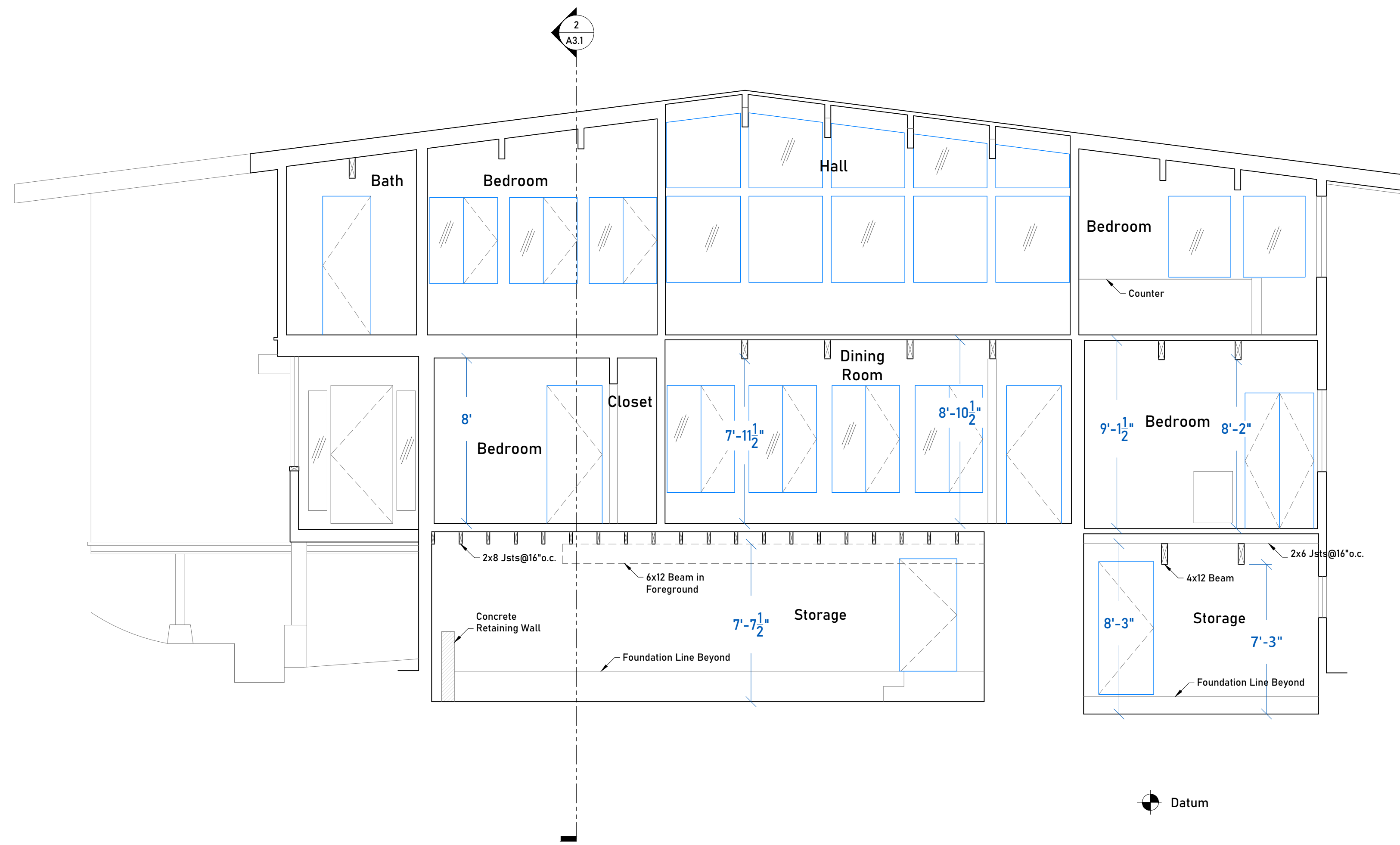
1 LONGITUDINAL SECTION